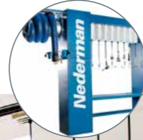
Oil taps mounted in service towers, service gauges, in oil cabinet walls or ceilings exactly according to your requirements.