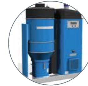
Mobile and stationary vacuum cleaners as well as accessories such as pre-separators, cleaning or hose reels.