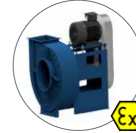
Extractor fans for exhaust fumes, welding fumes, vapours and dust are also available with ATEX rating.