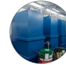
Tanks for bulk liquids that are pumped out to hose reels, and the transport of waste liquids.