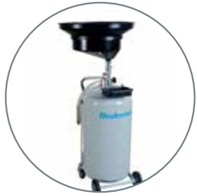
Waste liquid management and mobile liquid distribution.