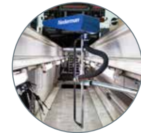
Safe and flexible waste oil rail with cleanable filter and adjustable funnel and arm.