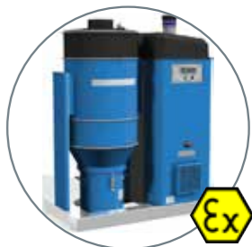
Accessories for cleaning and grinding extraction via high vacuum.