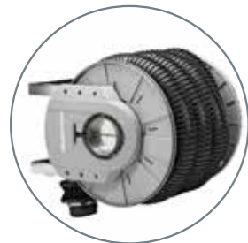
Cable reels for power supply, data traffic and lighting.

Exhaust extraction for fixed installations, swivel arms and rail-borne systems.