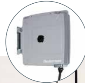
Hose reels for distributing liquids, gas and compressed air.